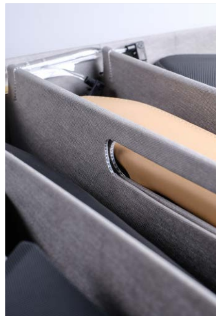
Superb surface protection

Contact us for more information, samples or prices.